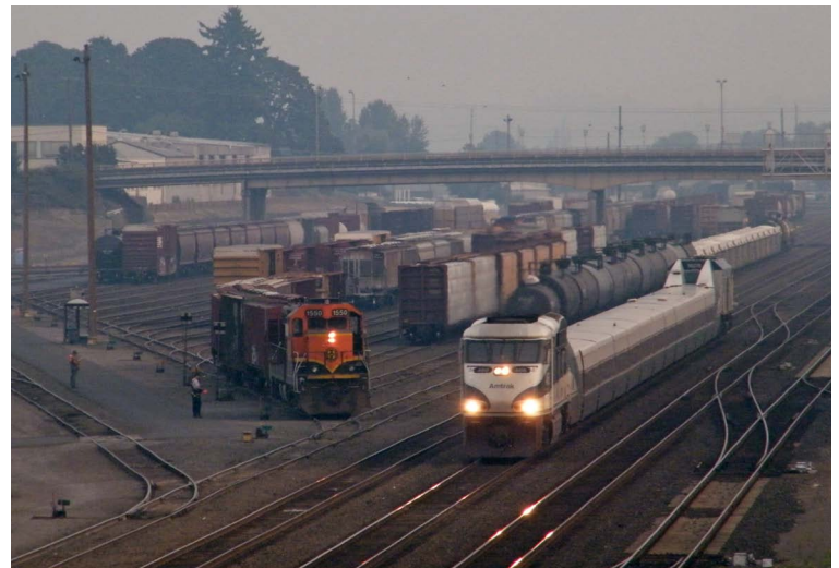
Above - A Seattle bound Amtrak Cascades makes its way past BNSF's Vancouver yard as chopped nose SD9 #1550 works a cut of cars in the yard.