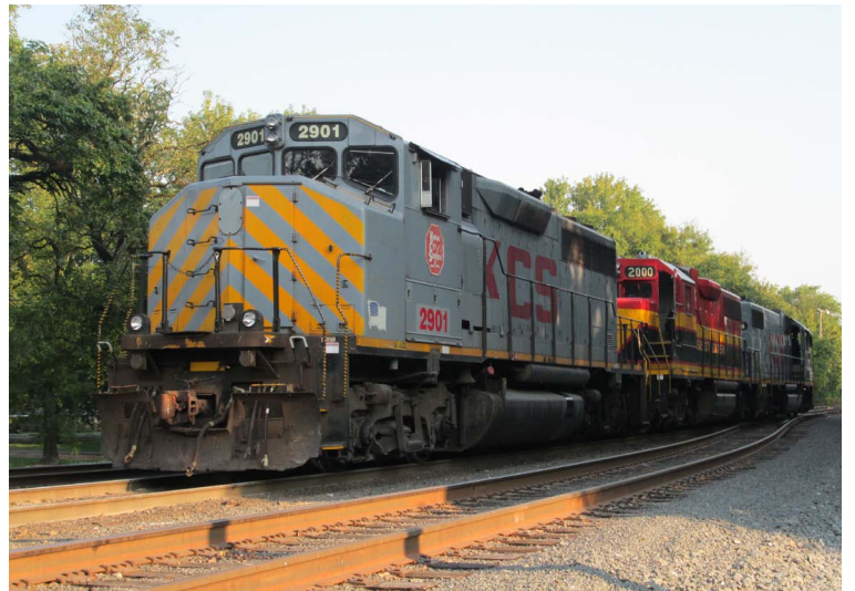
Two Old Gray Mares & A Southern Belle Kansas City Southern's Aberdeen Local has just arrived at the Artesia, MS yard and begun it's set out on 05-Sep-2015. This is the former GM&O yard that has seen owners Illinois Central Gulf and short-lived regional Gulf & Mississippi come and go before coming under the KCS umbrella in 1995.