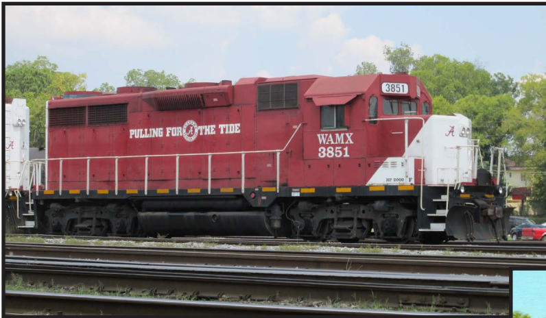
Left - Game Day in T-Town College football fans in Tuscaloosa aren't the only ones "Pulling For The Tide" during the Wisconsin-Alabama game on 05-Sep-2015. One of two GP35R units for WATCO's Alabama Southern in Tuscaloosa fly the colors while switching the former ICG yard. - Chris Dees