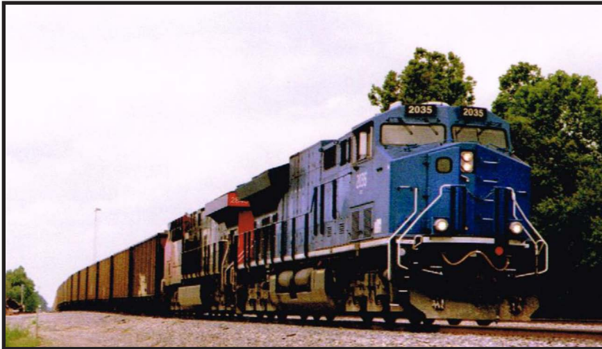
Left - A southbound loaded coal train is led by General Electric's Tier IV Demonstrator locomotive #2035 on a late summer afternoon. -Wallace Henderson