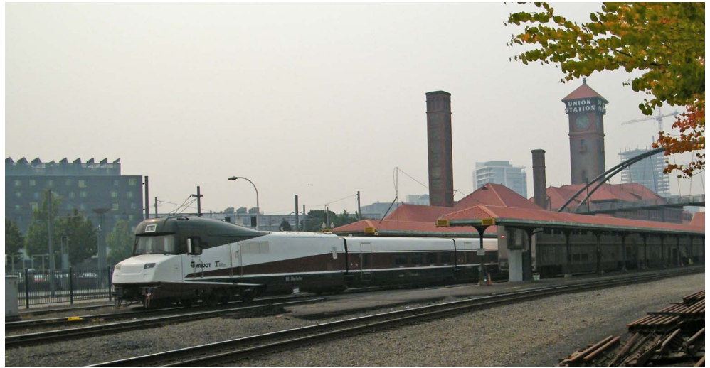
Above - Amtrak Cascades makes a stop at Portland Union Station on Saturday, August 22. If you look close, you can see the rear end of the 4 car Portland segment of Amtrak's Empire Builder. Once it departs, it will head for Spokane to be added to make up the full Empire Builder, along with the Seattle segment, and depart for Chicago. Did you notice the smoke in the sky?

Not being one to watch the news, I had no idea the severity of the drought or wildfires in Oregon and Washington. I