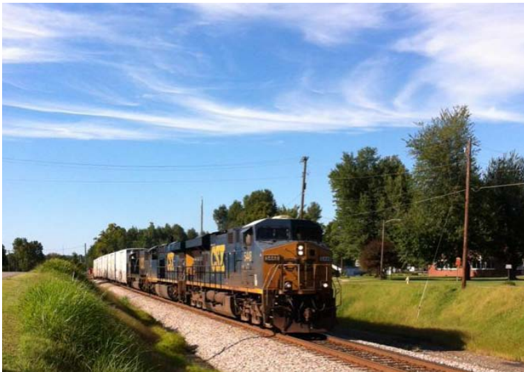
A south bound tote train with reefer cars on the head end hits Morton Junction, Mortons Gap KY at 4:41 PM. (08/24/15)