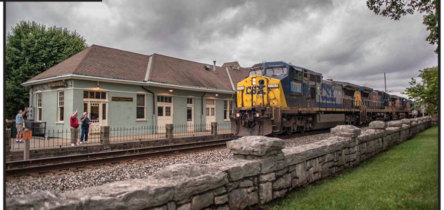
Right - Some of the members of the West Kentucky Chapter of the National Railway Historical Society wave as a CSX southbound freight train passes the old L&N Depot as it heads south on the Henderson Subdivision at Hopkinsville, Ky. The chapter was having a cookout and meeting at the historic old depot