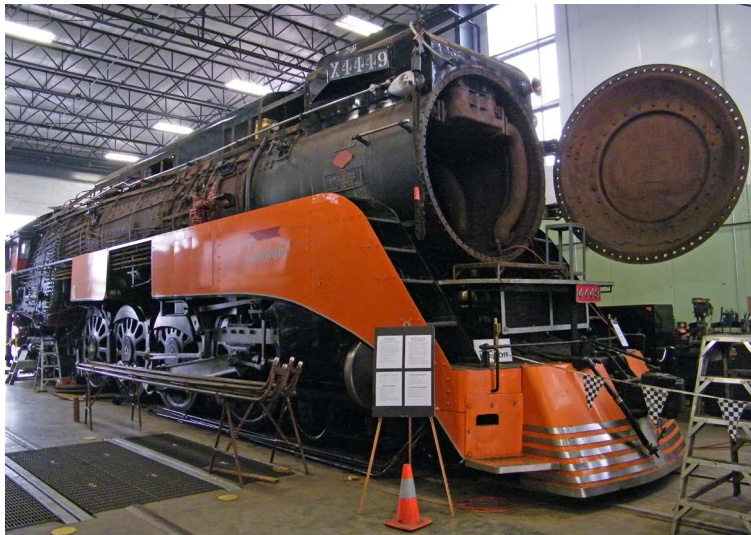
Left - At the Oregon Rail Heritage Center, Southern Pacific GS-4 4449 gets a major overhaul. The big Lima-built 4-8-4 is getting its 15-year boiler inspection, and other needed maintenance is being done concurrently. The work was begun in February 2013 and should be completed in Fall of 2015, with the engine ready for use on the Holiday Express in December 2015. When photographed on August 22, 2015, all flues and tubes had been installed, rolling was done on both ends, welding was done on the flues and tube at the rear flue sheet, and firebox work (including installing new steel at the throat sheet and new circular tubes) was underway. A new superheater unit installation will begin shortly, after which there will be a full hydrostatic test of the boiler. It will be great to see this old Daylight engine operating again - and when it is done, then work begins on Spokane Portland & Seattle 4-8-4 700!