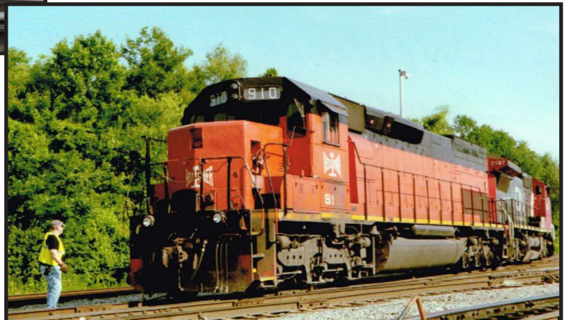
Right - P&L NorthYard, Paducah with power off the just arrived L-513 from Fulton (the IC "FUPD") on 8/13. B&LE SD40-3 #910, rebuilt from SP SD45T-2R #6825 by DM&IR Proctor MN. shops in 2000. Have read that CN is beginning to repaint these B&LE units so was glad to photo one before that happens.